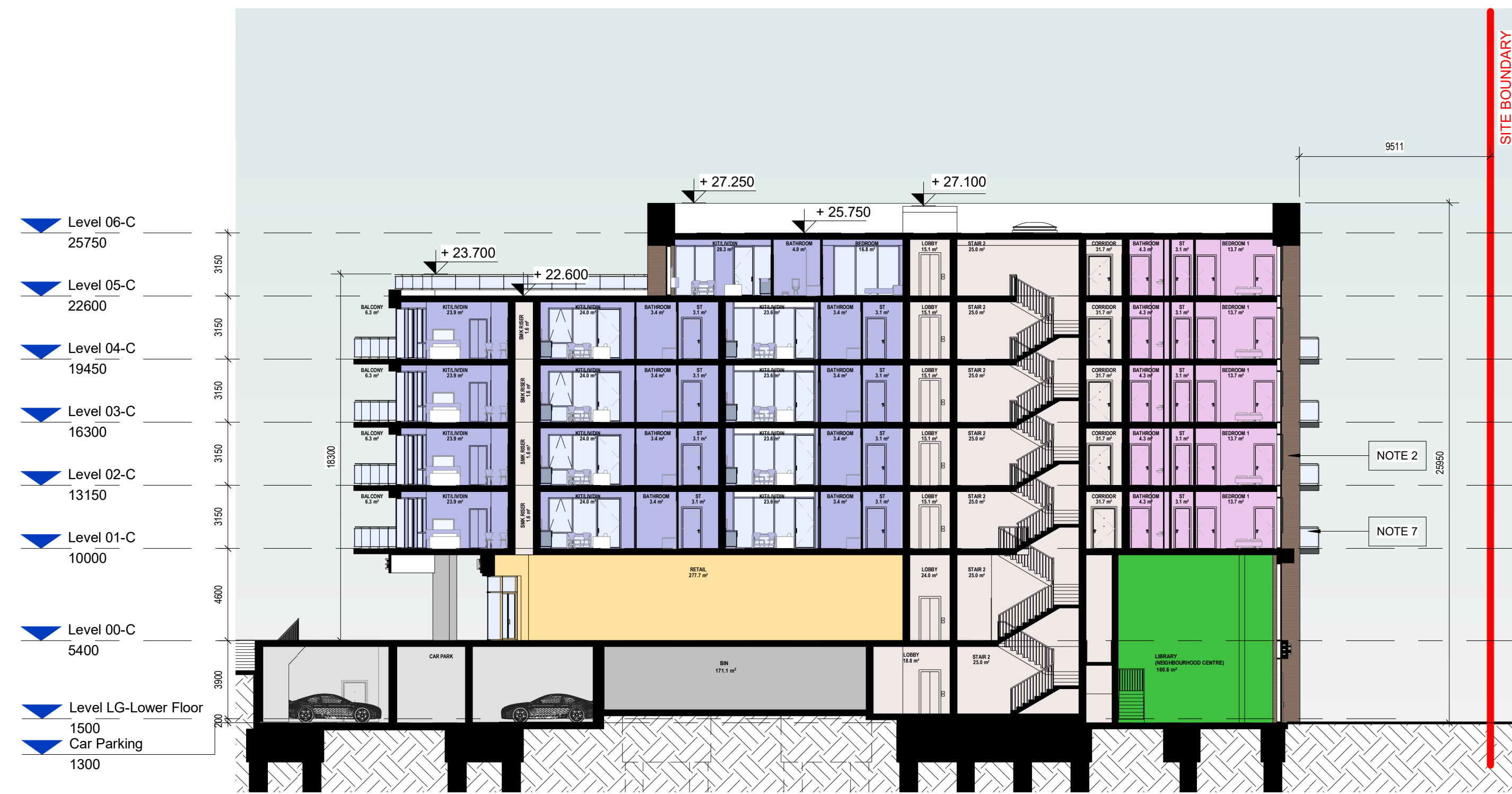
1 BLOCK C-SECTION A-A 1 : 200