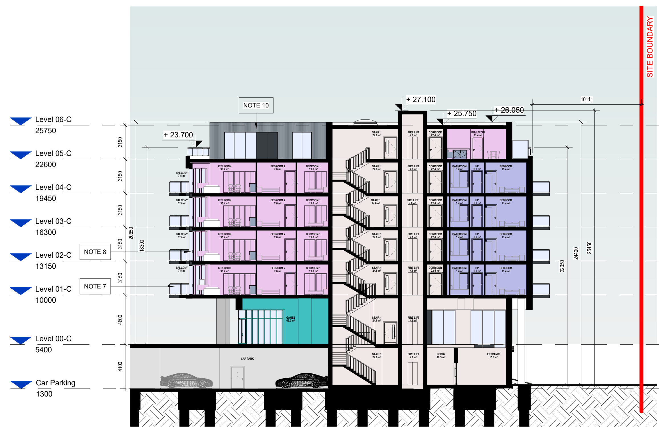
2 BLOCK C-SECTION C-C 1 : 200